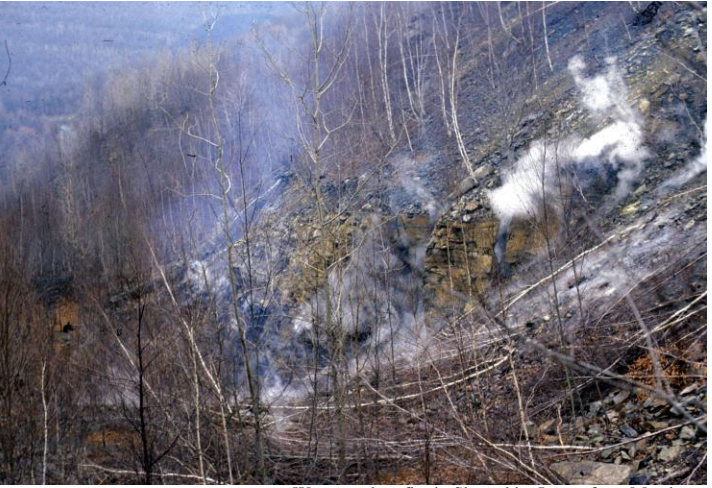
Waste coal on fire in Shamokin, Image from Marsh

Locally, environmental problems associated with coal mining are very present. Specifically, the environment and landscape of Shamokin has been greatly impacted. Near Shamokin Gap, there is much evidence of the once thriving coal boom. The world's largest pile of anthracite waste coal, or culm, has an evident presence in this area (Marsh, 1987). In fact, there is an entire culm bank due to the Glen Burn Mine resting in the outskirts